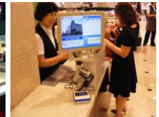
Retail & Mart